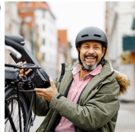
Live Our Shared Values