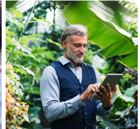
Shape the Future